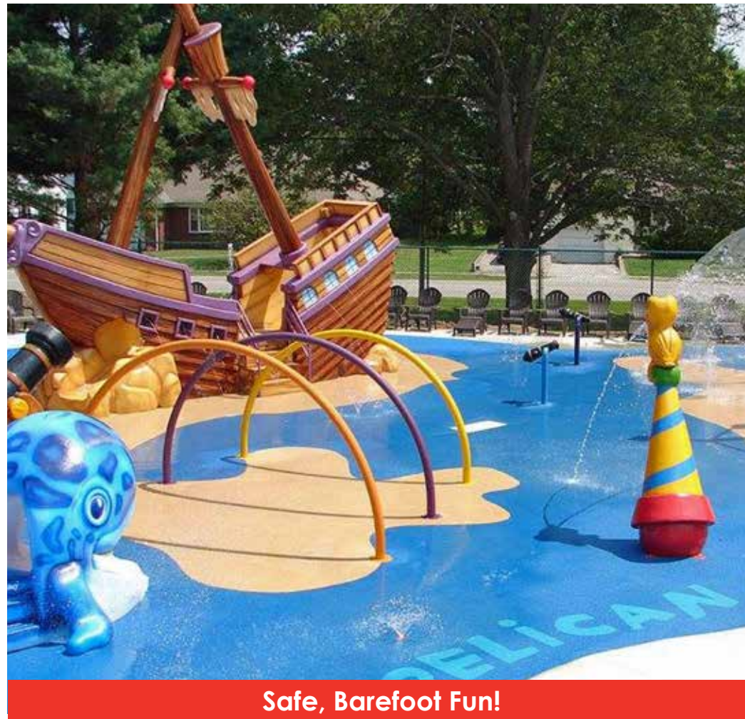
Safe, Barefoot Fun!

No Fault Sport Group provides coast-to-coast installation service to ensure consistent quality and premium customer service for all of our poured-in-place surfaces!