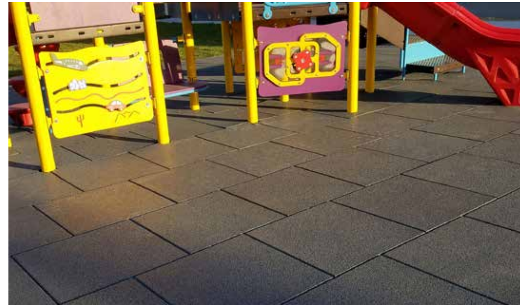
Durable & Accessible