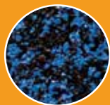
50% Blue 50% Black