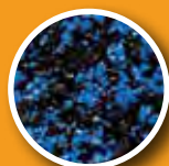
50% Blue 50% Black